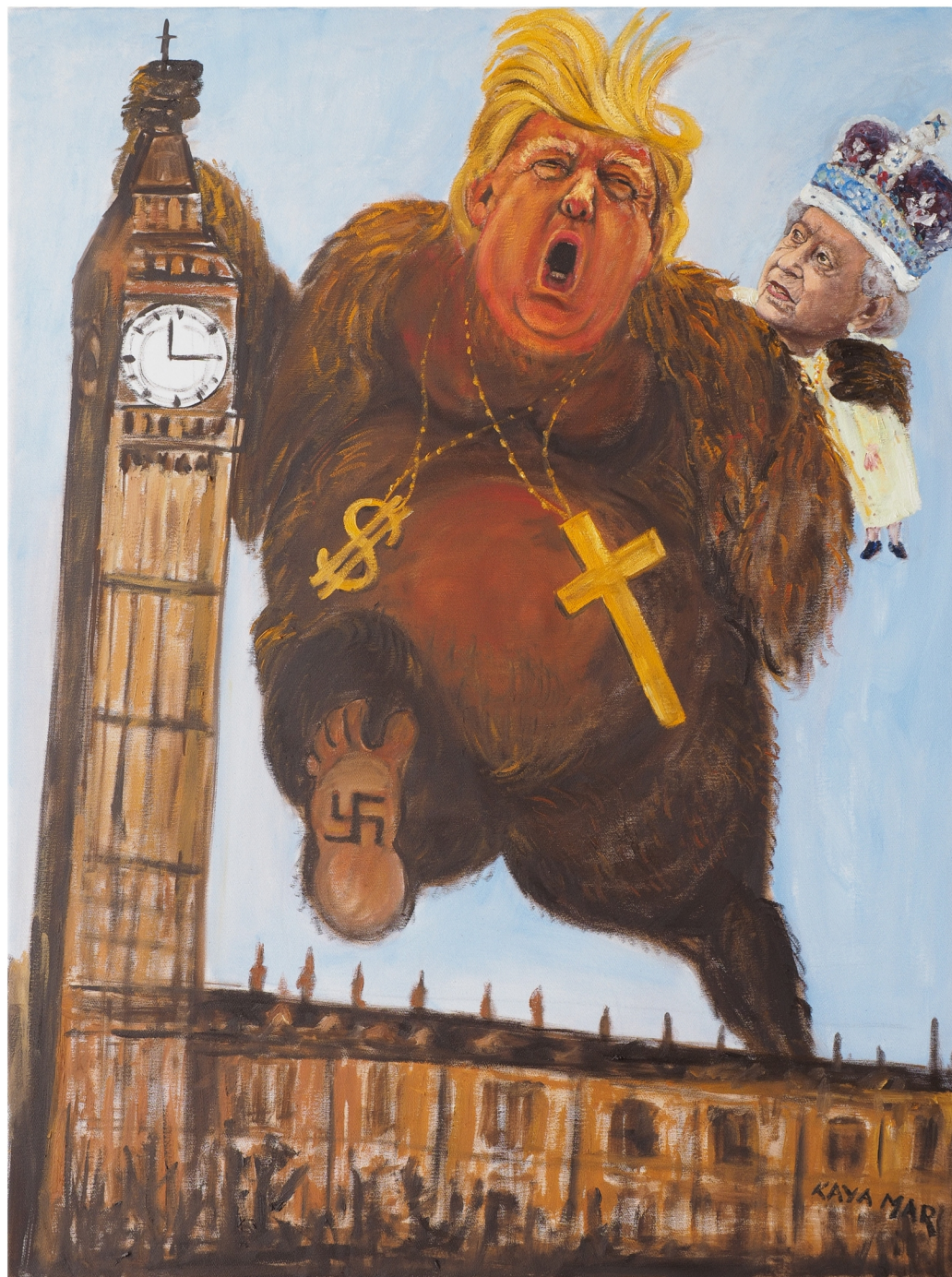
Donald Trump, Queen Elizabeth "The Queen used as bait for Trump's State Visit" (2017)