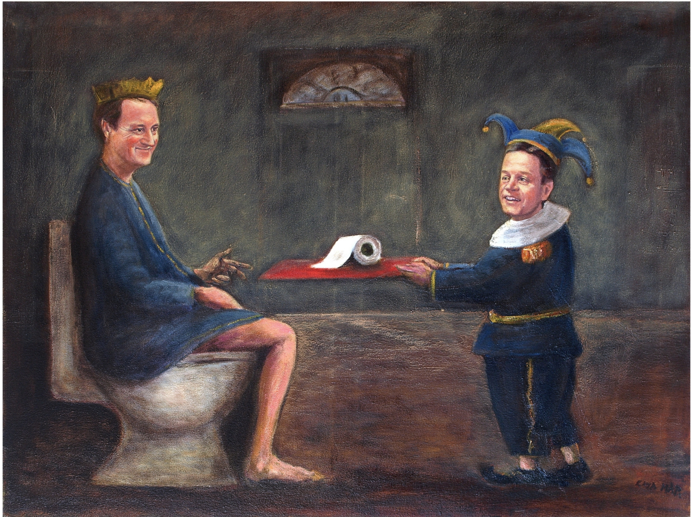
David Cameron & Nick Clegg "The Jester Attending King David On His Throne" (2011)