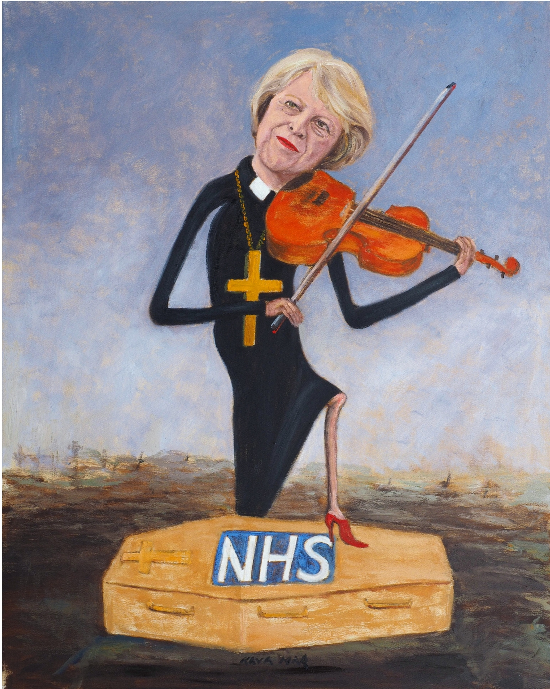
Theresa May "The Vicar's Daughter Serenades the Death of the NHS" (2017)