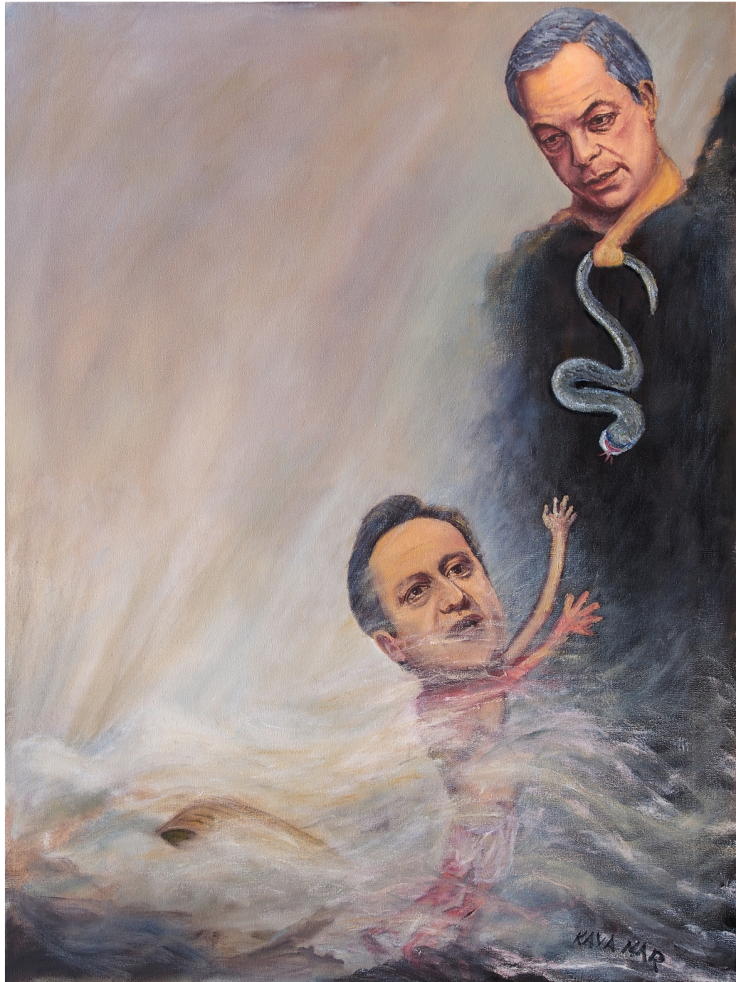
David Cameron & Nigel Farage "Will Cameron Grasp the Serpent to Save Himself?" (2015)