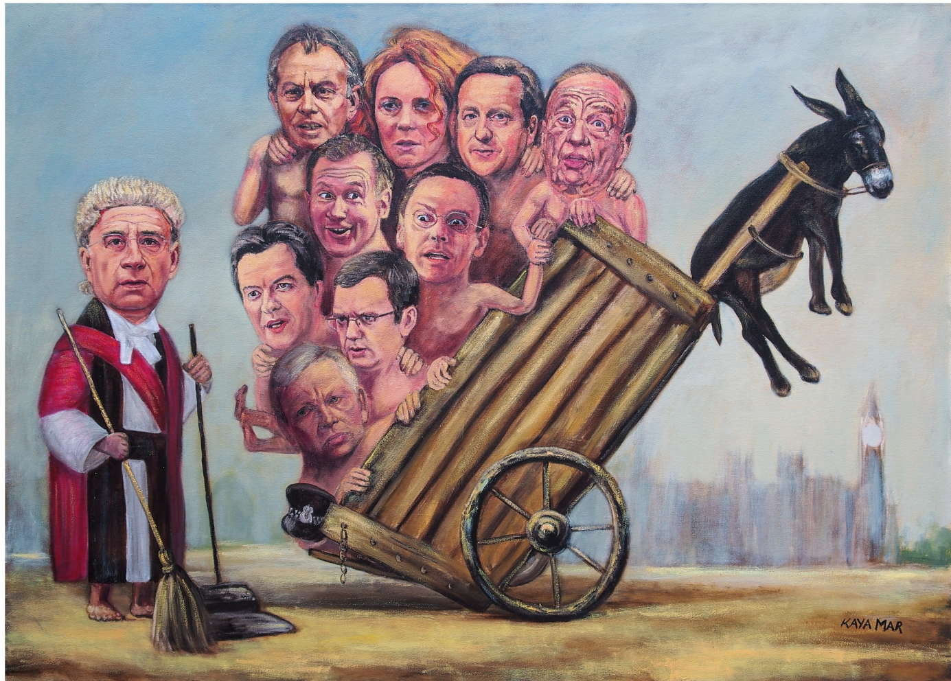
Leveson Inquiry "We're All In This Together" (2012)