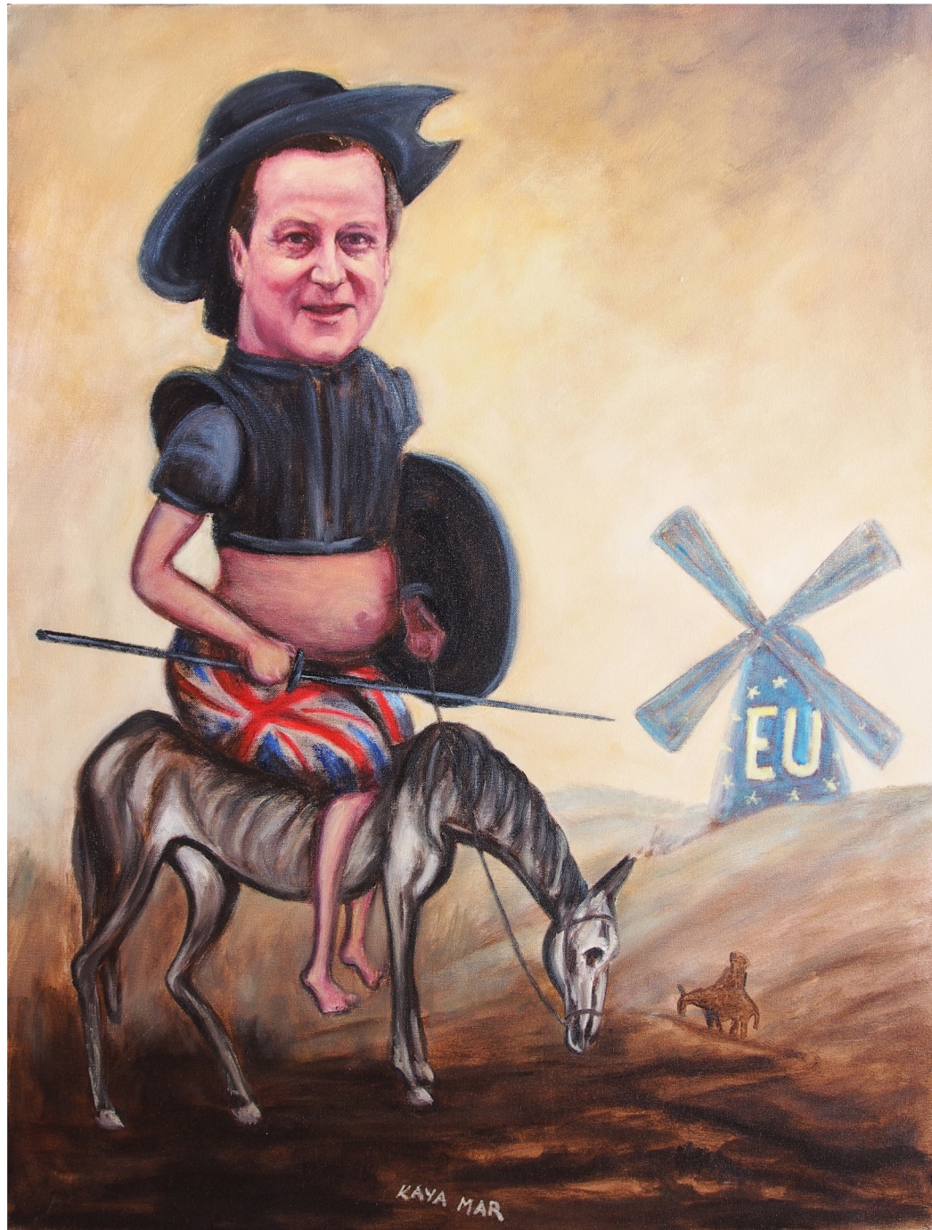
David Cameron "Dave Quixote tilting against the EU windmills" (2014)