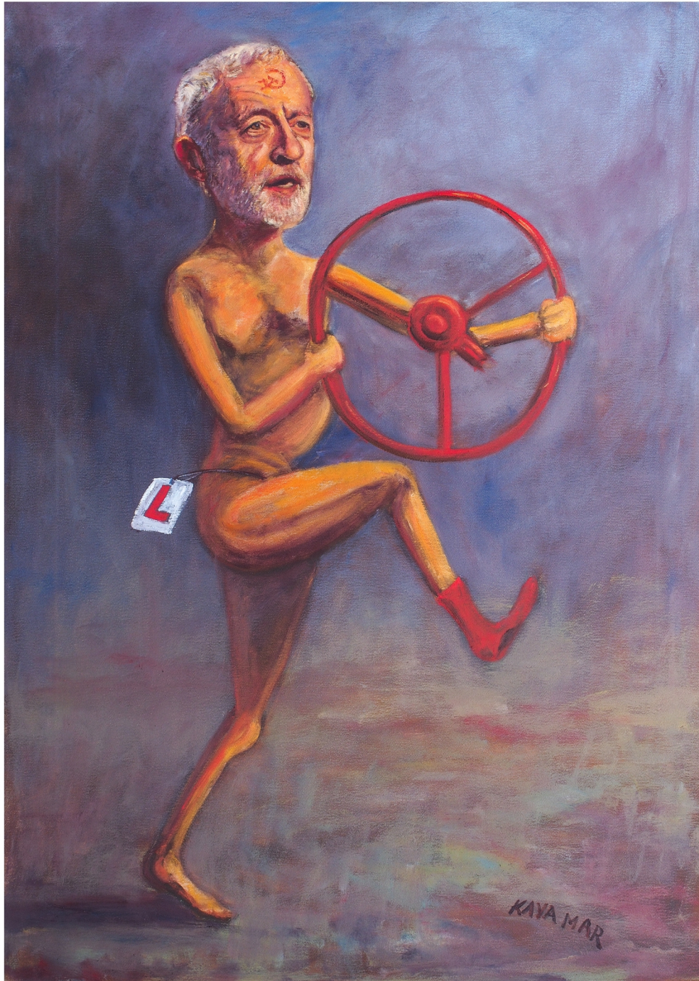
Jeremy Corbyn "Crash Course for the Learner Driver" (2015)