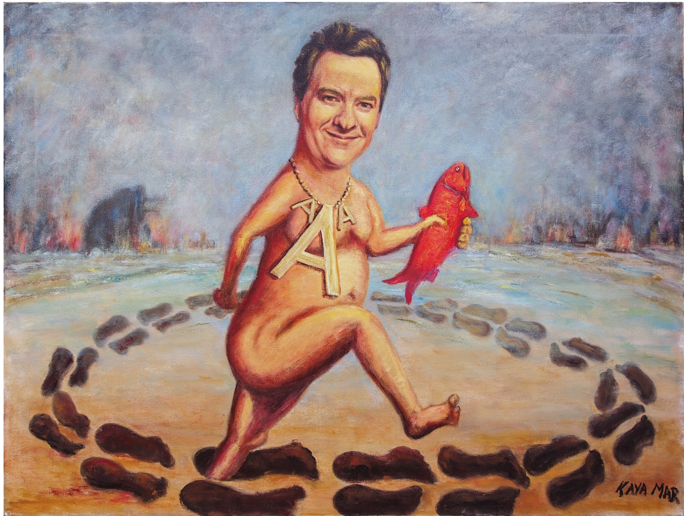
George Osborne "Waving Red Herrings While Losing the Triple-A" (2013)