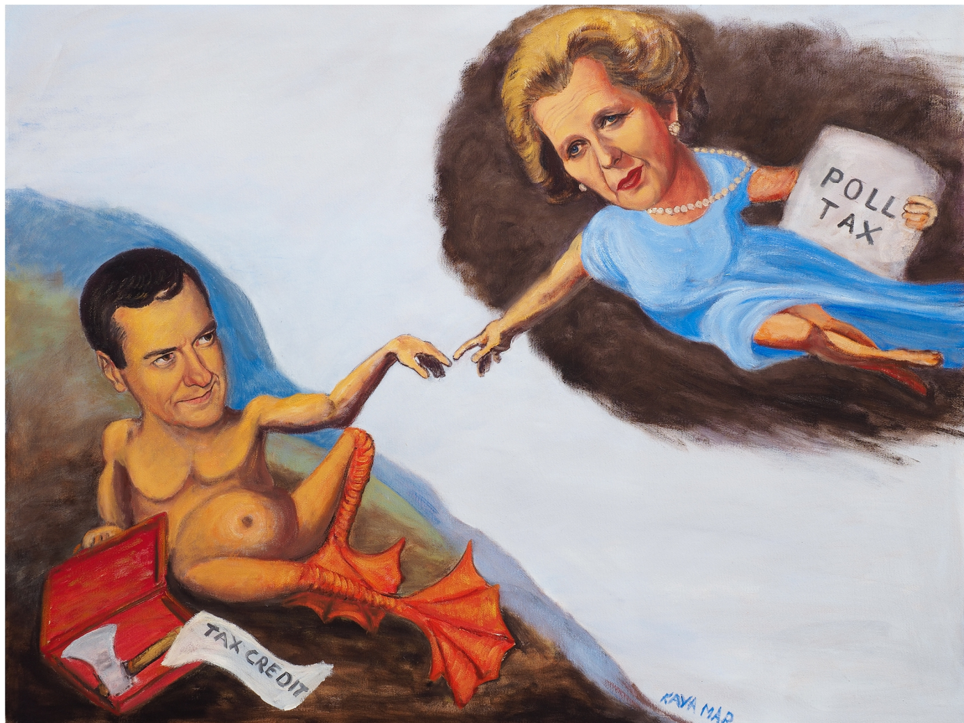
George Osborne & Margaret Thatcher "The Creation of Gideon" (2015)