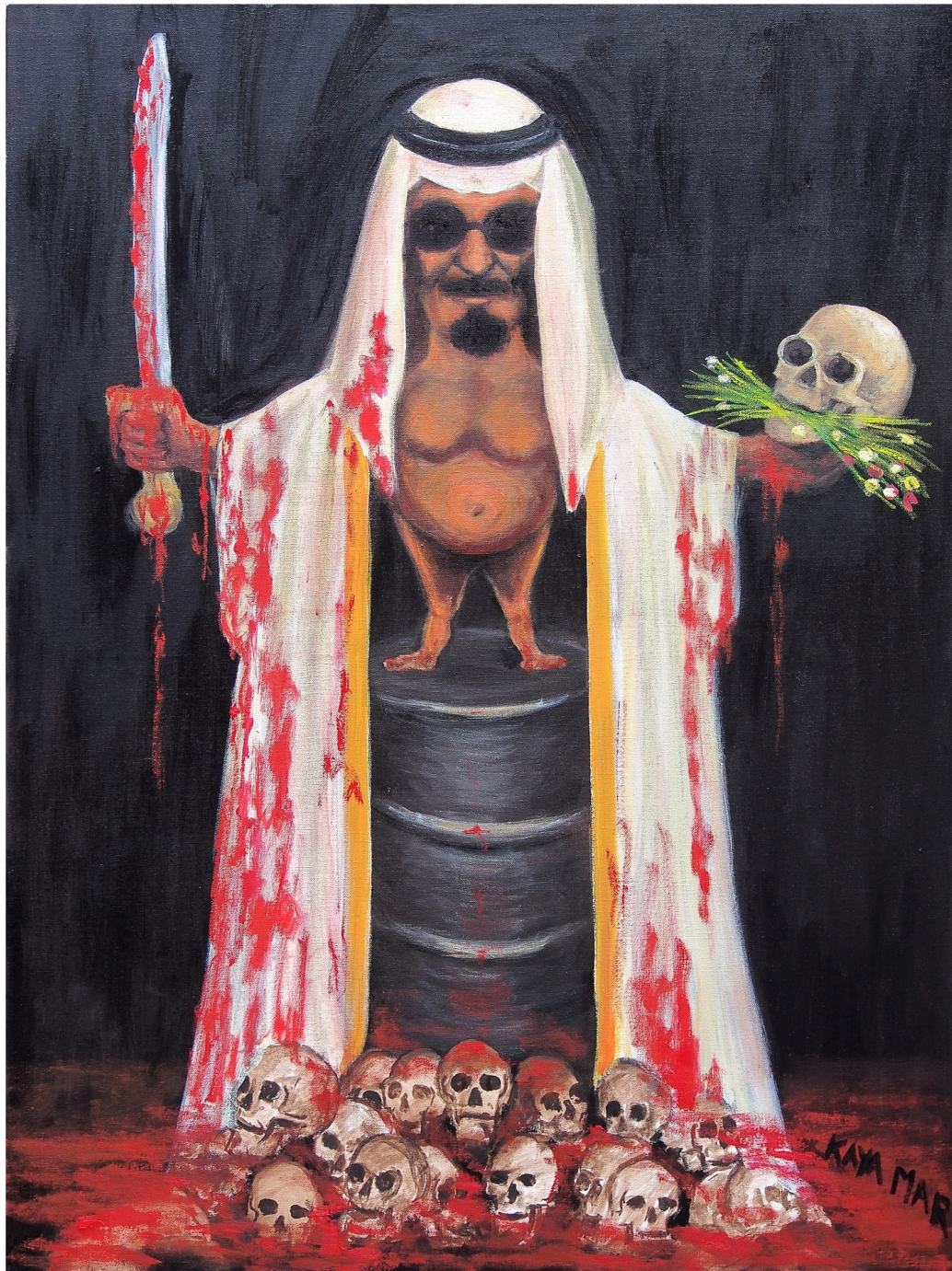
"The Death of the Arab Spring" (2013)