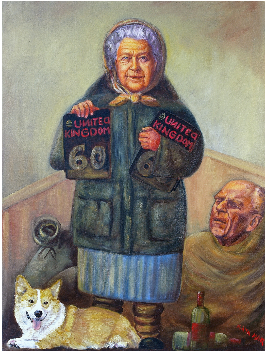
"The Queen's Diamond Jubilee in Austerity Britain" (2012)