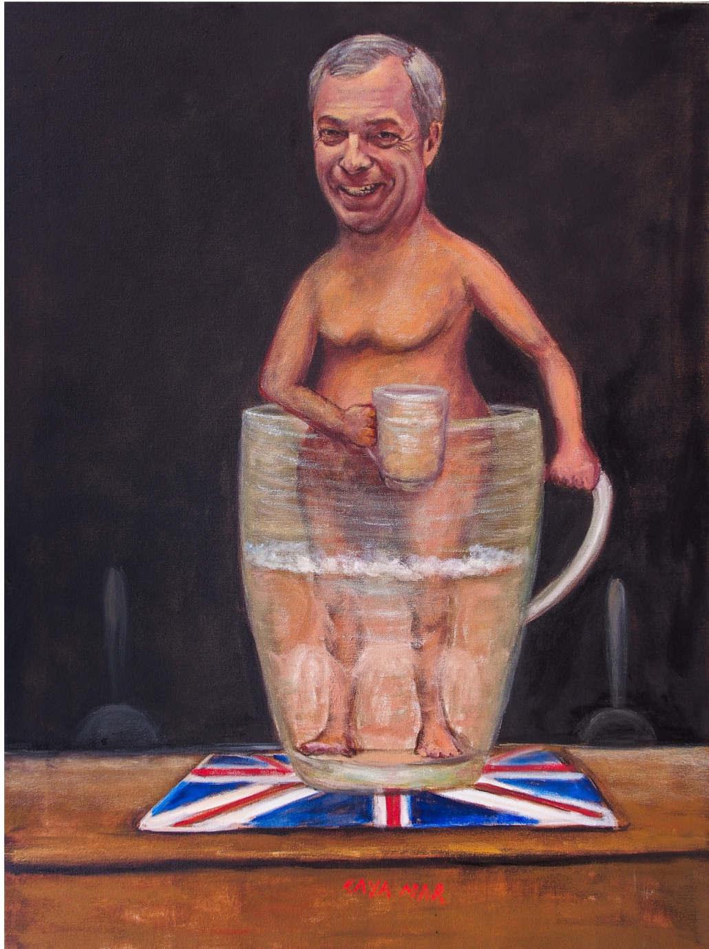
Nigel Farage "Dreaming Up UKIP Policies in the Pub" (2015)