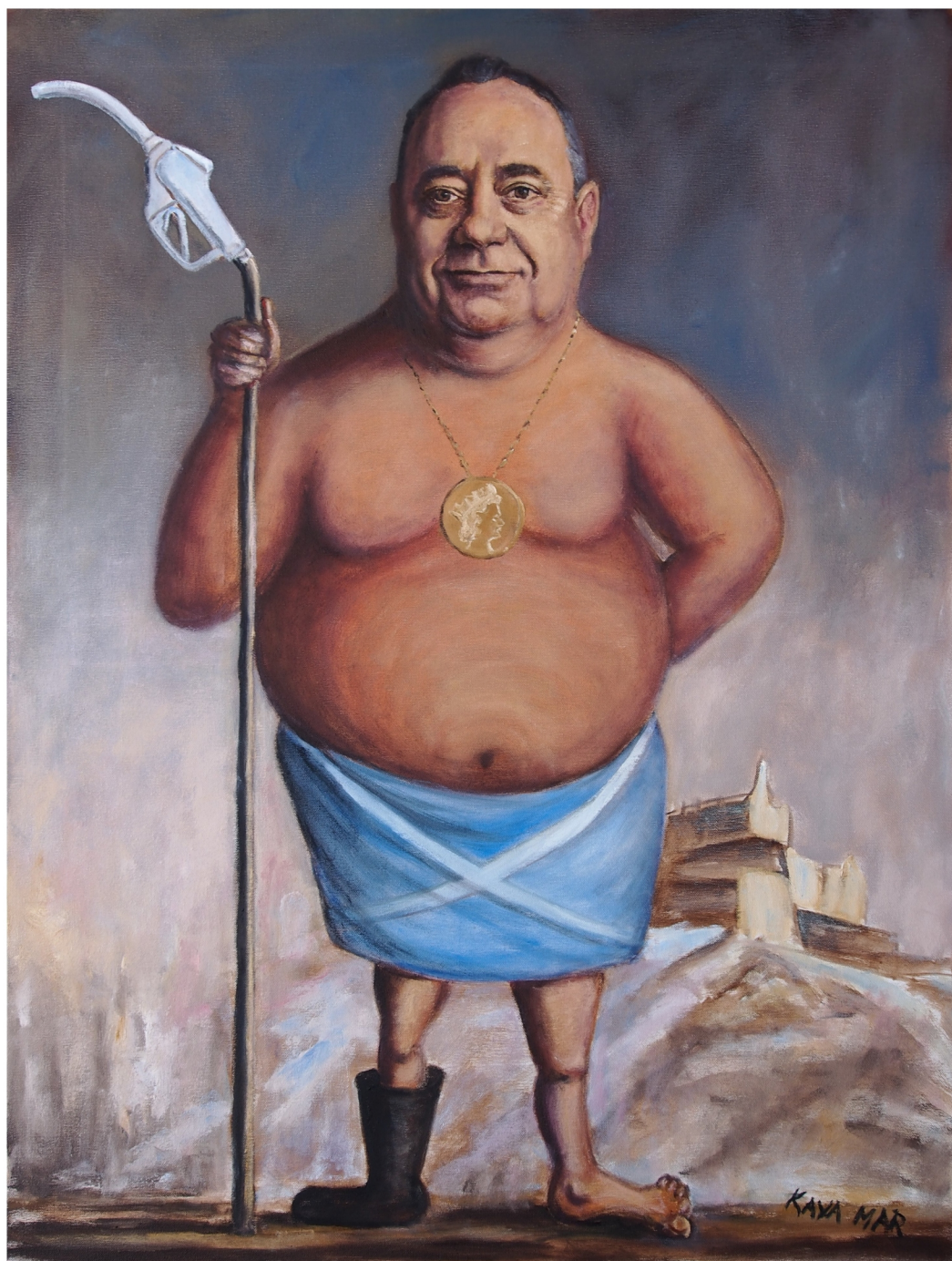
Alex Salmond "The Pope of Scotland" (2014)