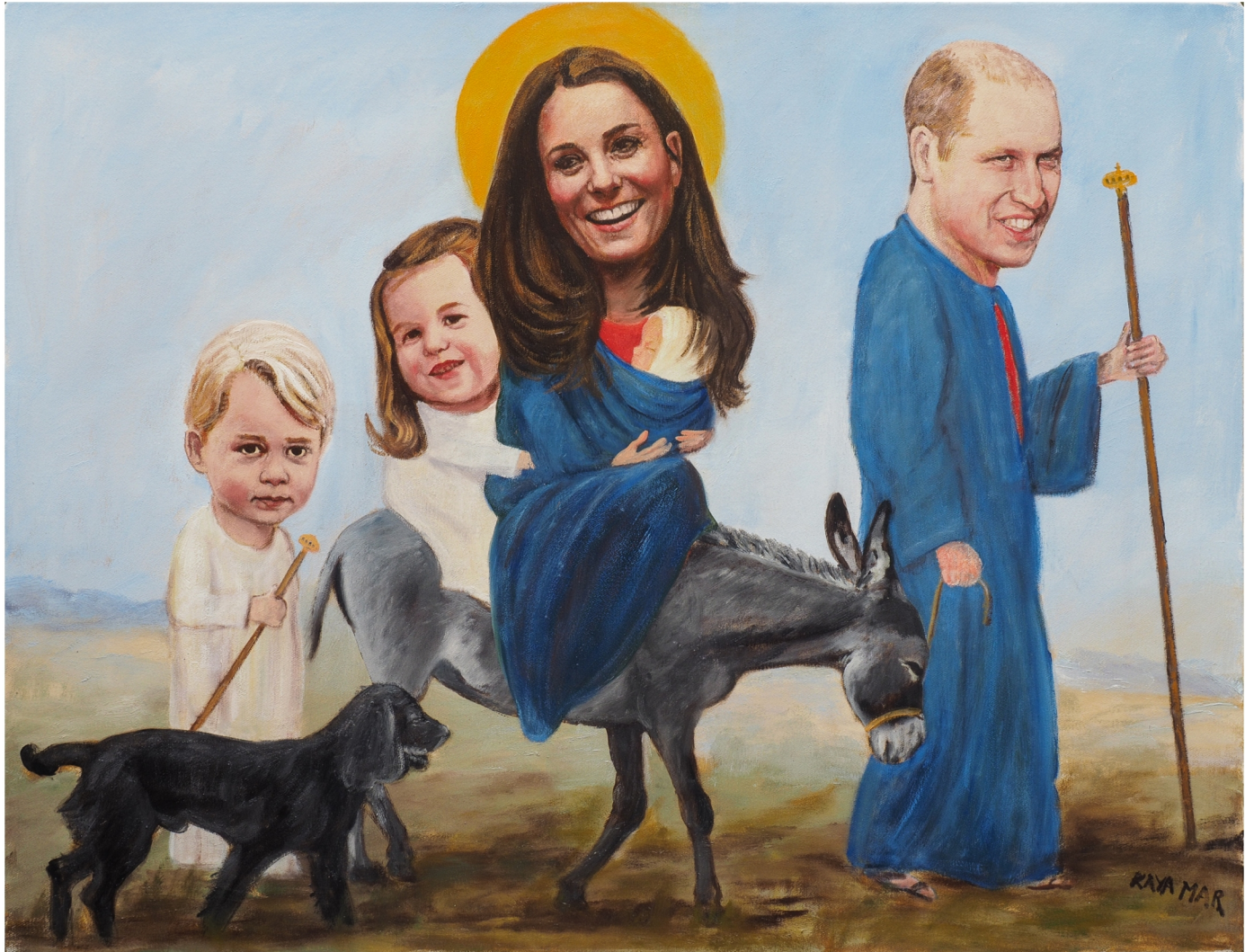
The Duke & Duchess of Cambridge "Saint Kate delivers a royal hat-trick" (2018)