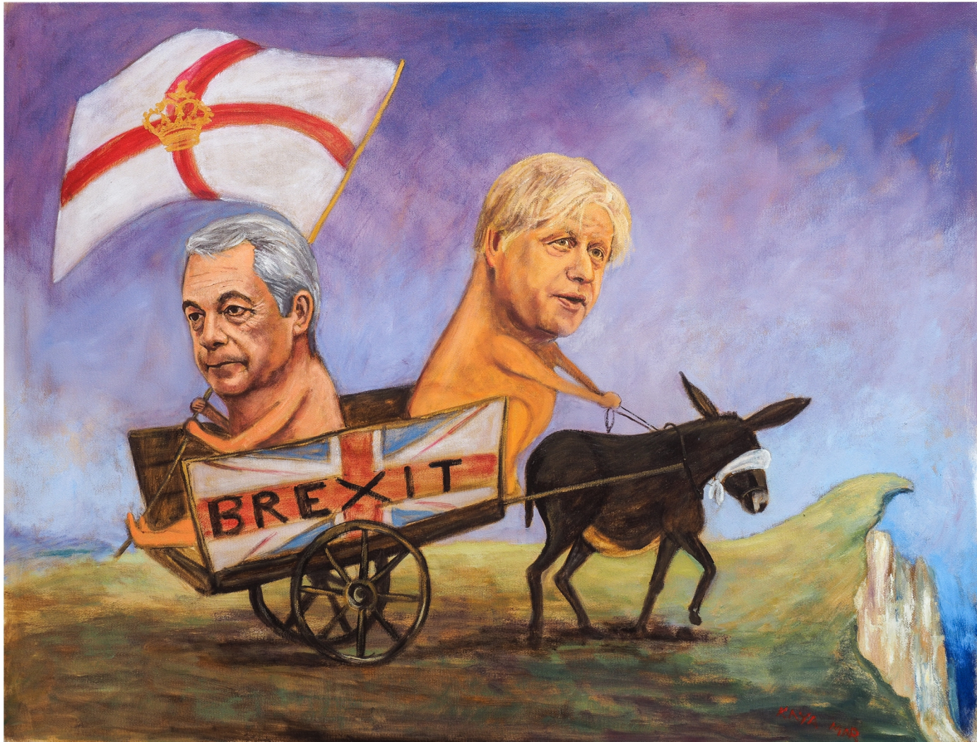
Nigel Farage & Boris Johnson "Blindly dragging Britain over the precipice"(2016)