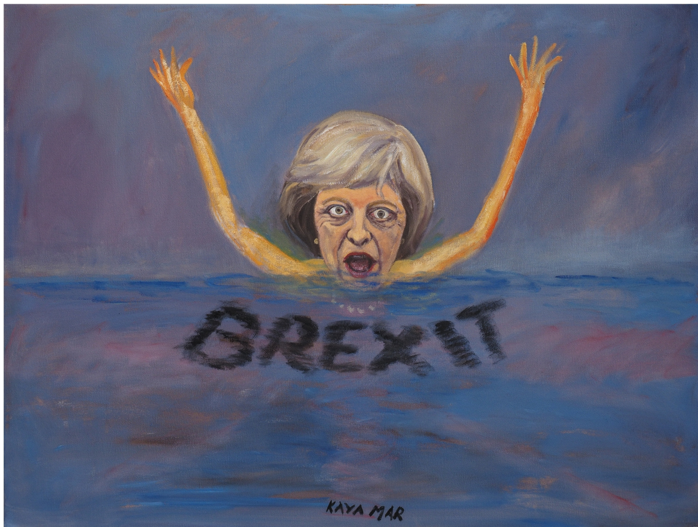
Theresa May "Brexit - Not Waving, But Drowning" (2017)