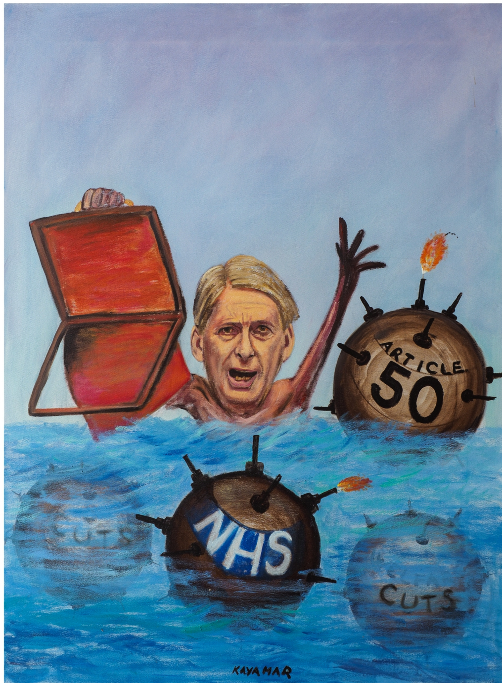
Phillip Hammond, Spring Budget "Hammond floundering in deadly waters" (2017)