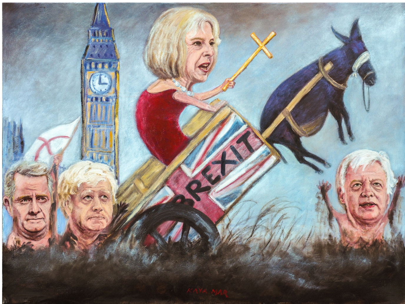
"St. Theresa and her Brexit ministers stuck in the Brexit swamp" (2016)