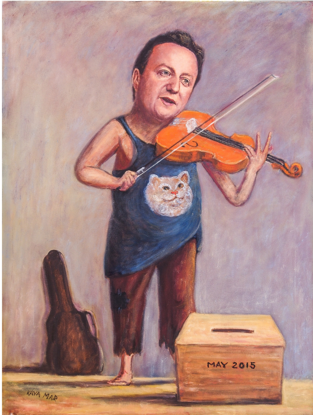
David Cameron, General Election 2015 "The Austerity Charlatan" (2015)