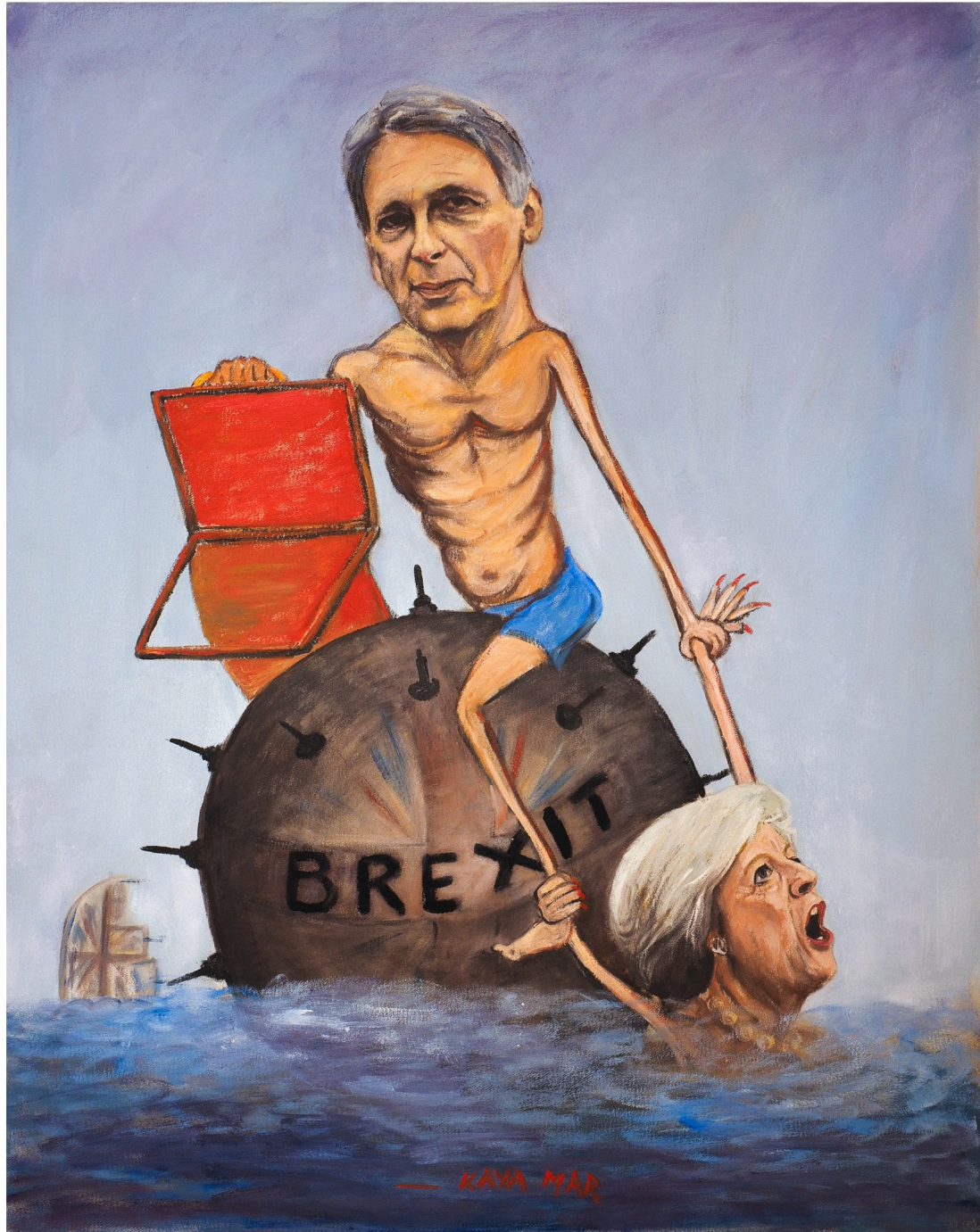
Phillip Hammond Autumn Budget "Theresa May's empty-handed ally can't save her" (2017)