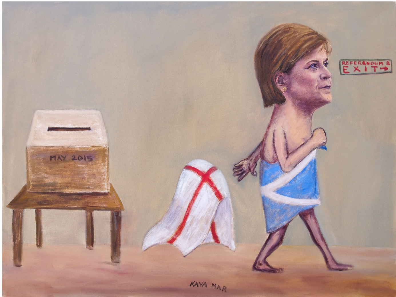
Nicola Sturgeon, General Election 2015 "Scotland rejects English rule" (2015)