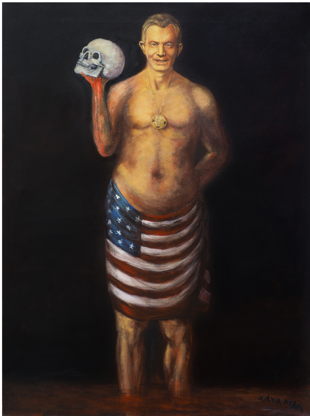
Tony Blair, Chilcott Inquiry "The Warmonger" (2010)