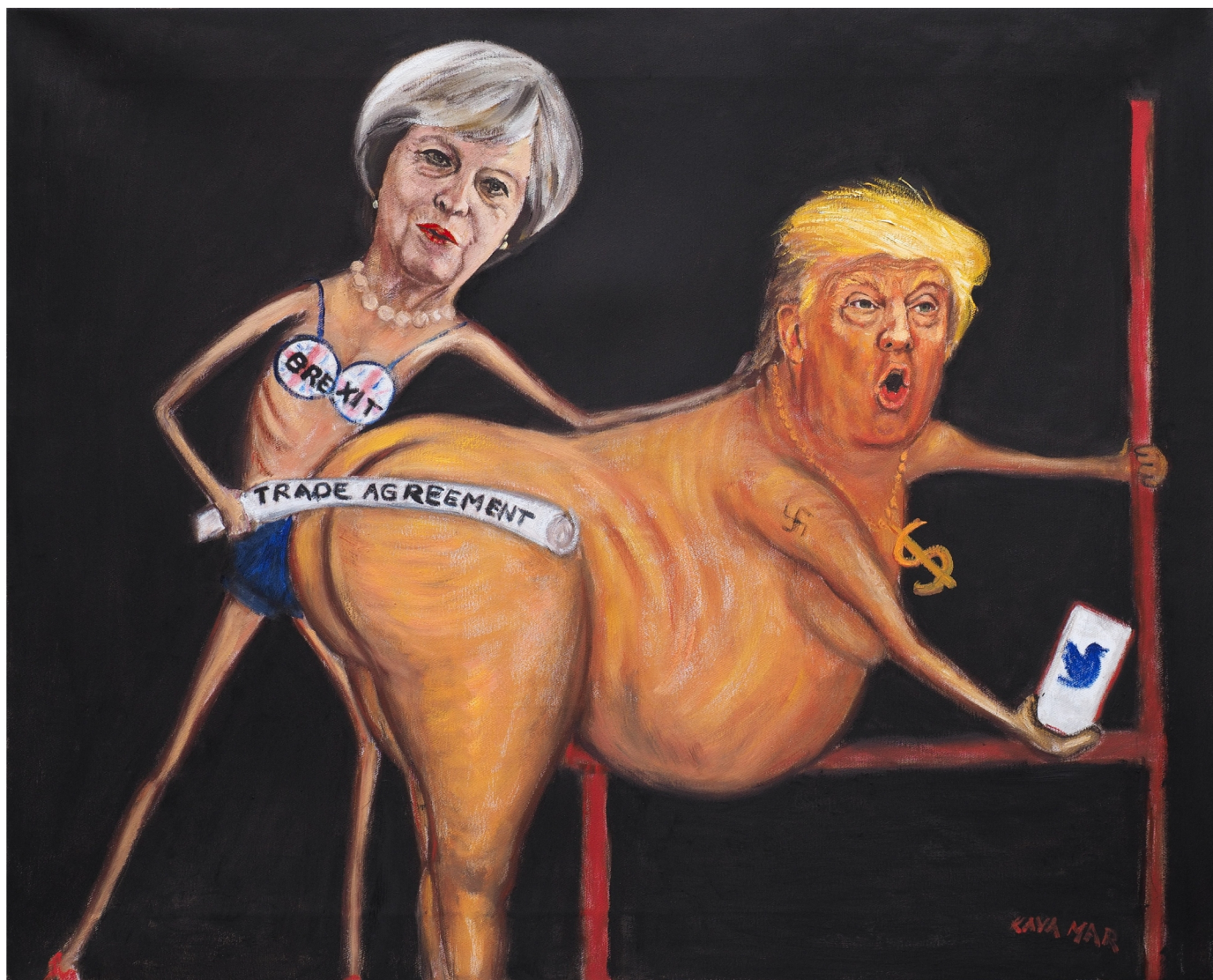
Theresa May, Donald Trump "Desperate Theresa works on that Special Relationship" (2017)