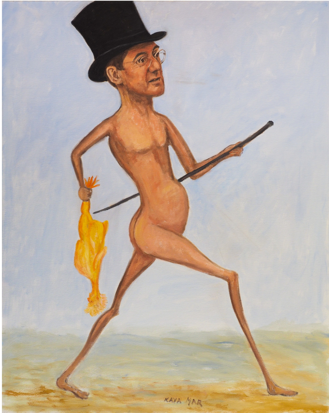
William Rees-Mogg "The Member for the 18th Century" (2017)