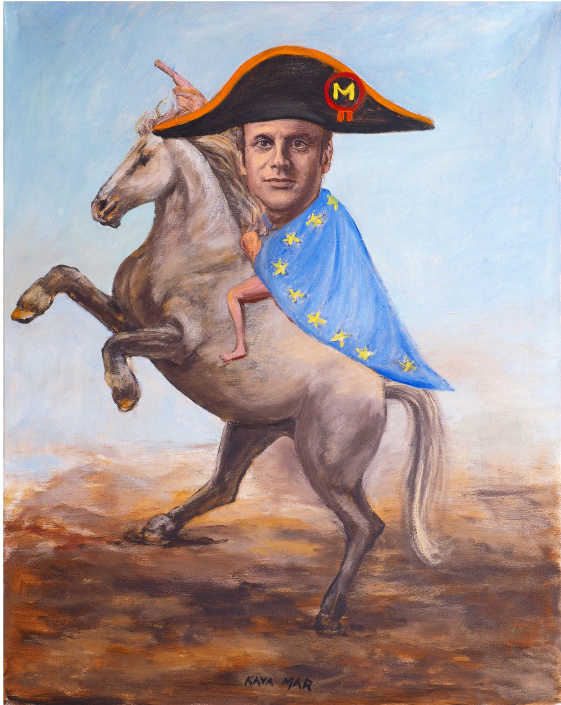
Emmanuel Macron "The new Napoleon" (2017)