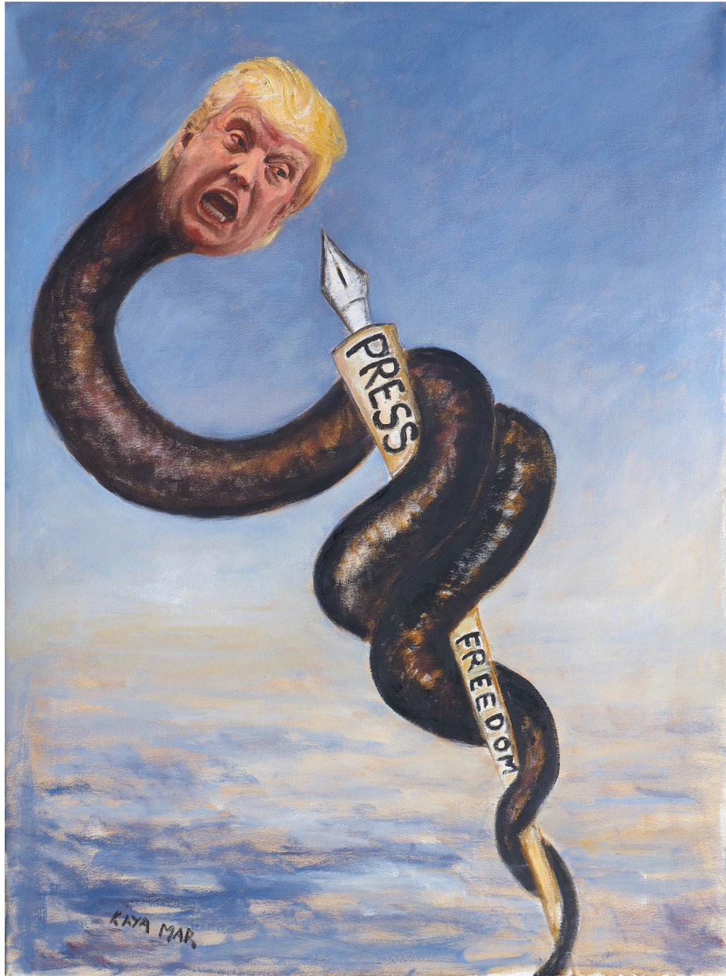
Donald Trump "Strangling Press Freedom" (2017)