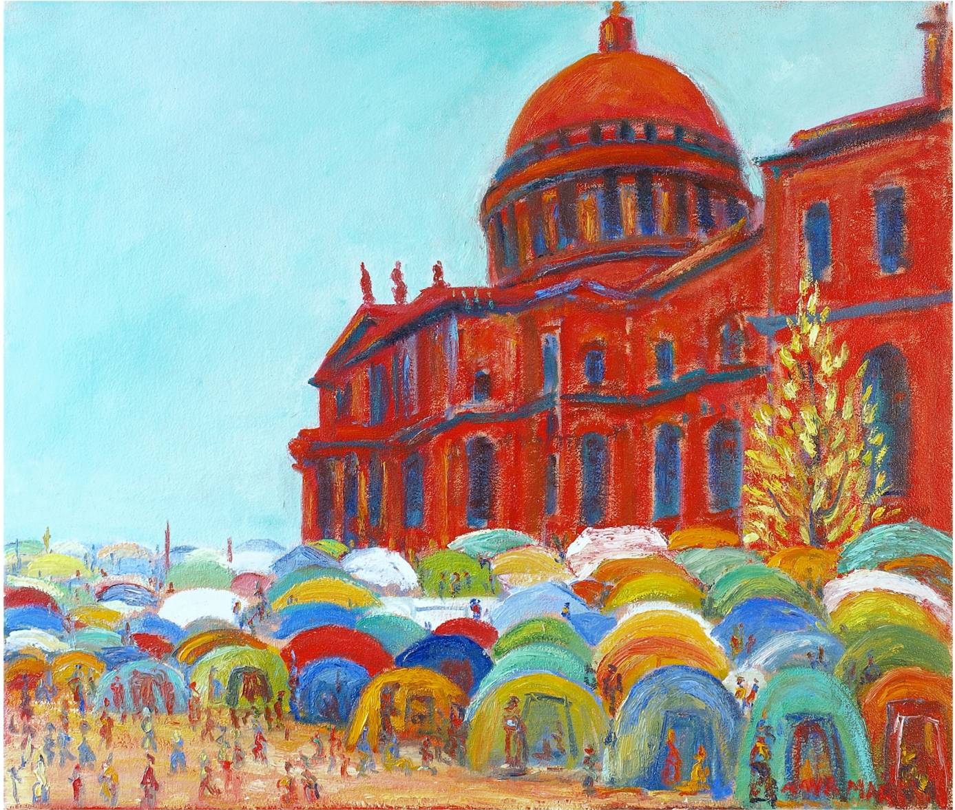
Occupy London Stock Exchange "Tent City at St. Paul's Cathedral" (2012)