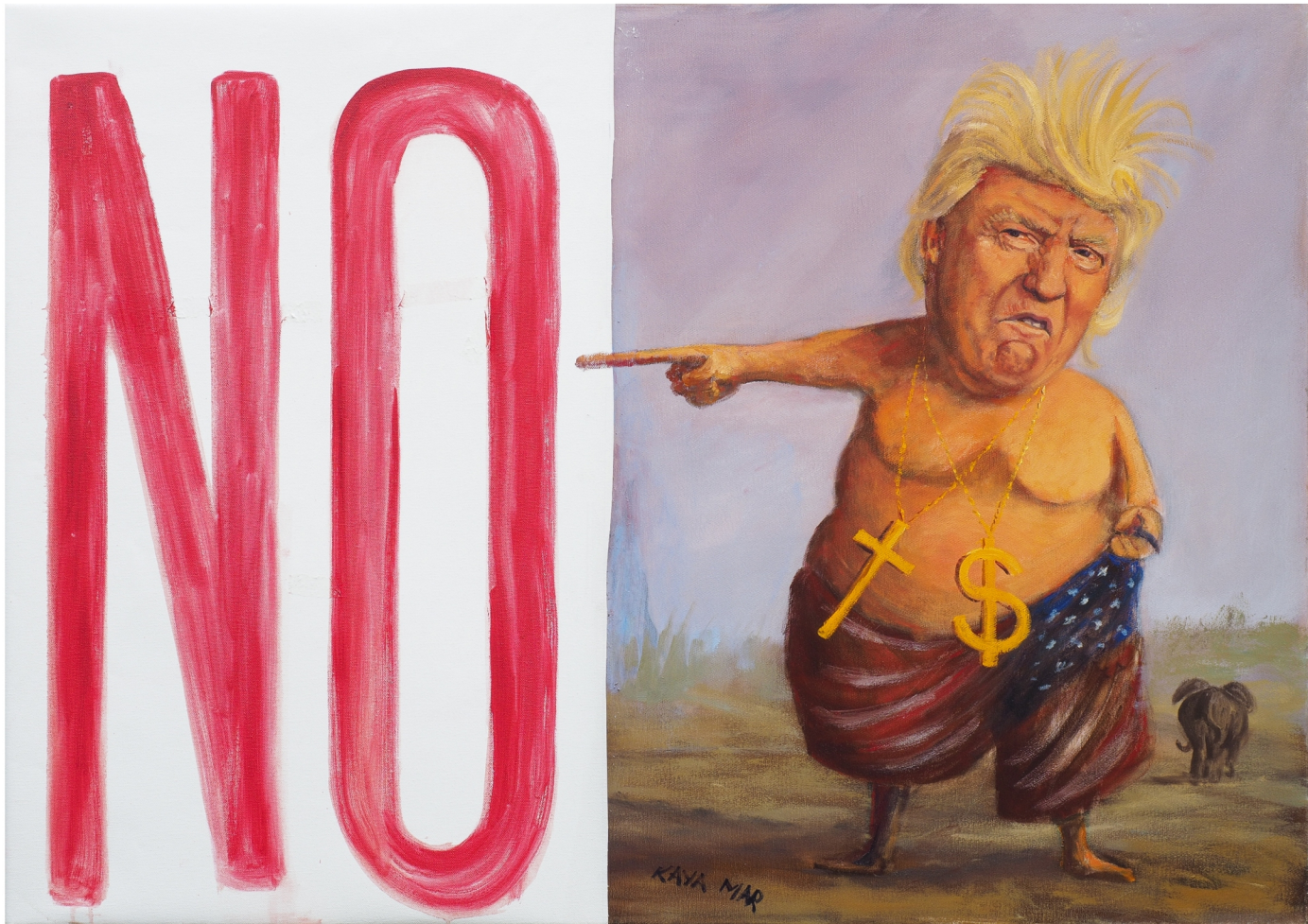
Donald Trump "Trump's global strategy" (2017)